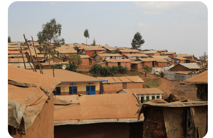
Pictured above is Gihembe refugee camp. Families navigate the daily hardships of scarce food, crowded shelter, and no electricity or running water.

"I was so excited! I told my family that dreams have no limit. God has thousands of ways He can use to help us."